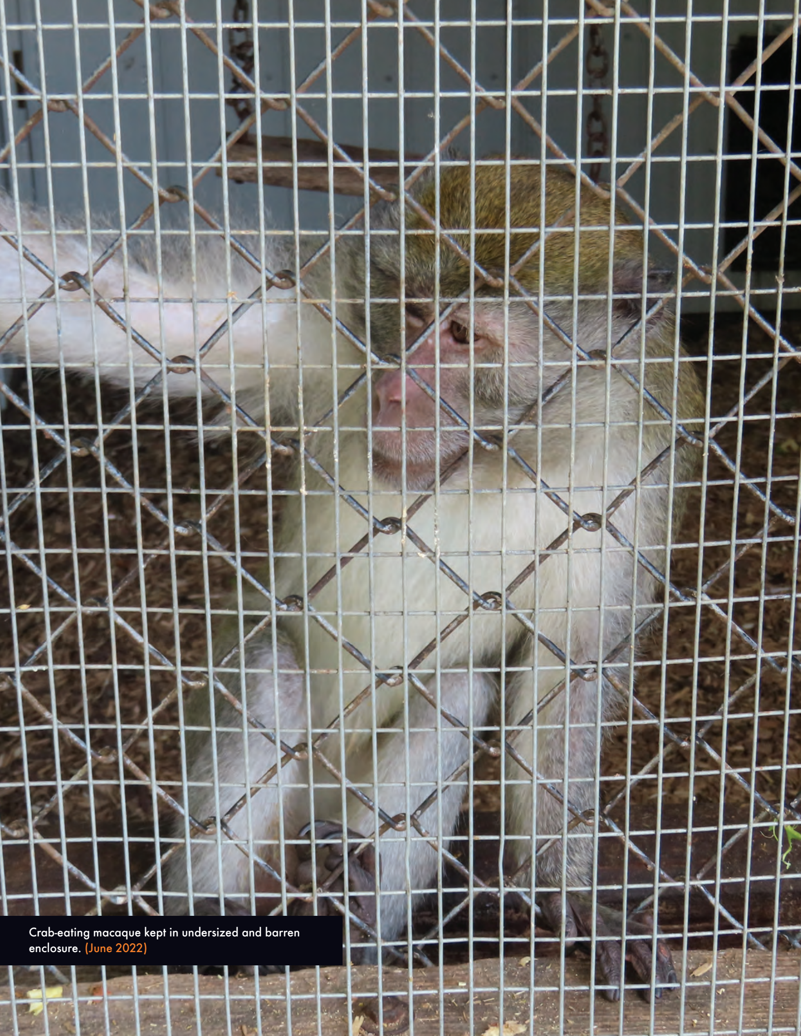
Crab-eating macaque kept in undersized and barren enclosure. (June 2022)