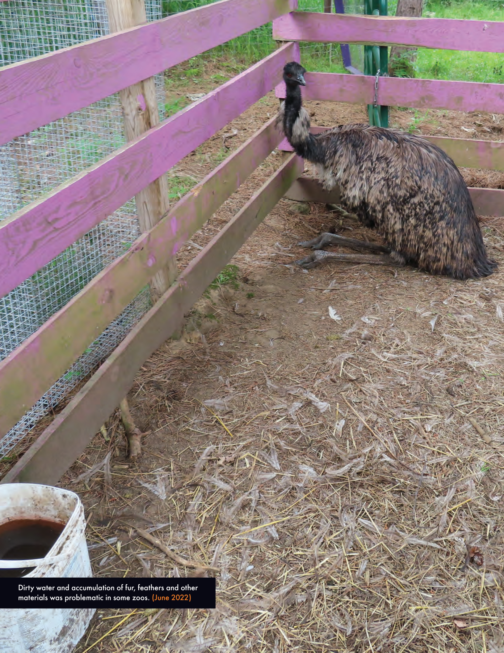
Dirty water and accumulation of fur, feathers and other materials was problematic in some zoos. (June 2022)