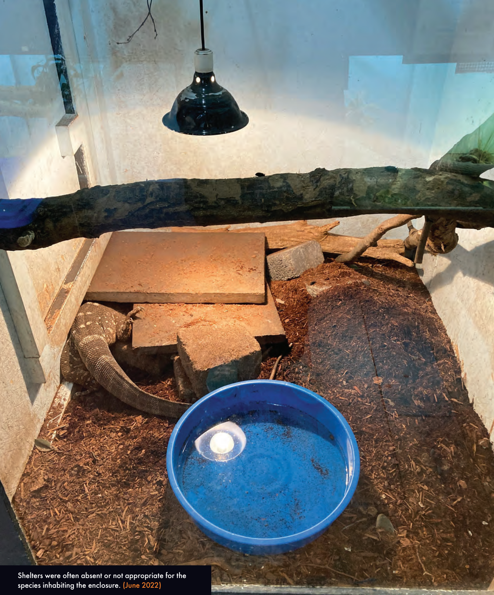
Shelters were often absent or not appropriate for the species inhabiting the enclosure. (June 2022)