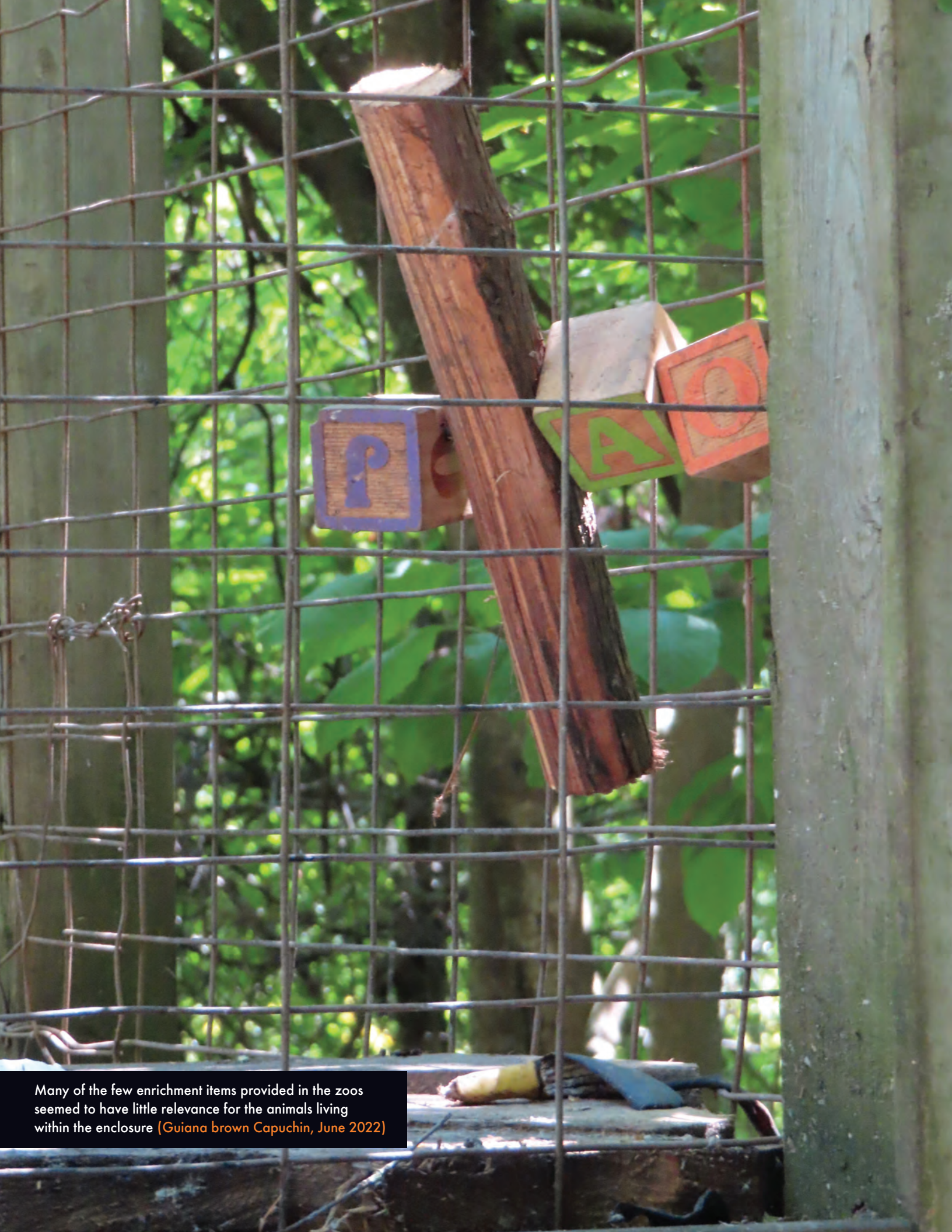
Many of the few enrichment items provided in the zoos seemed to have little relevance for the animals living within the enclosure (Guiana brown Capuchin, June 2022)