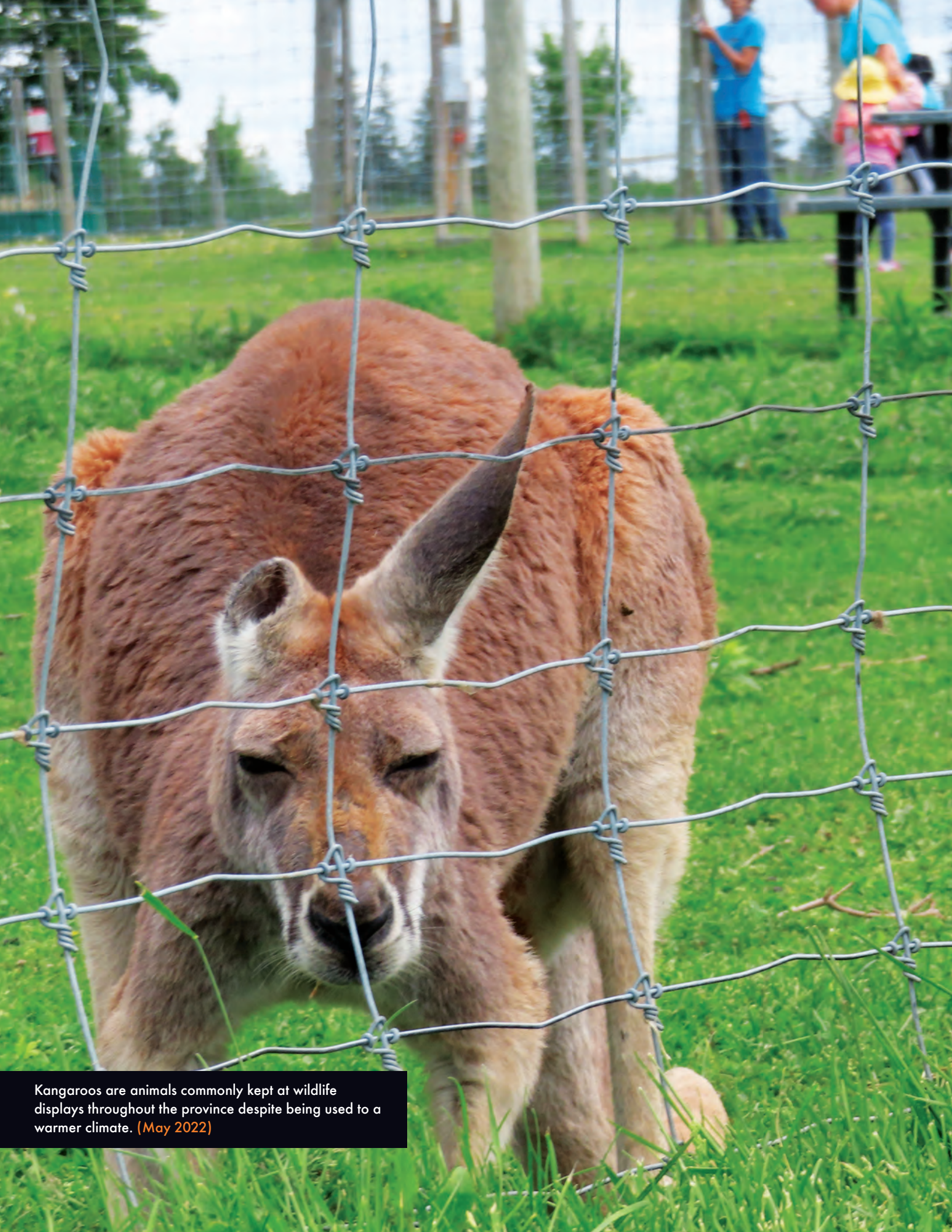
Kangaroos are animals commonly kept at wildlife displays throughout the province despite being used to a warmer climate. (May 2022)