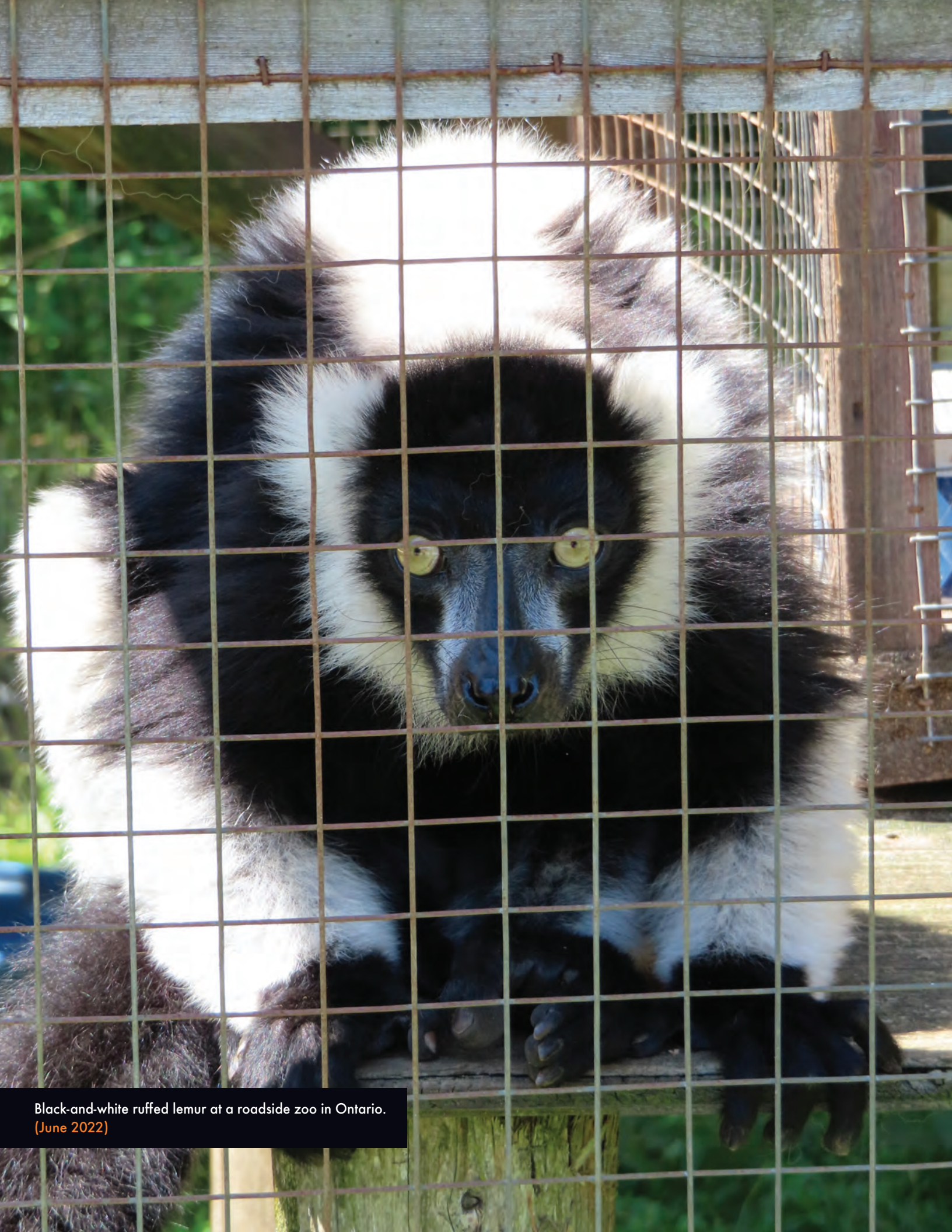
Black-and-white ruffed lemur at a roadside zoo in Ontario. (June 2022)