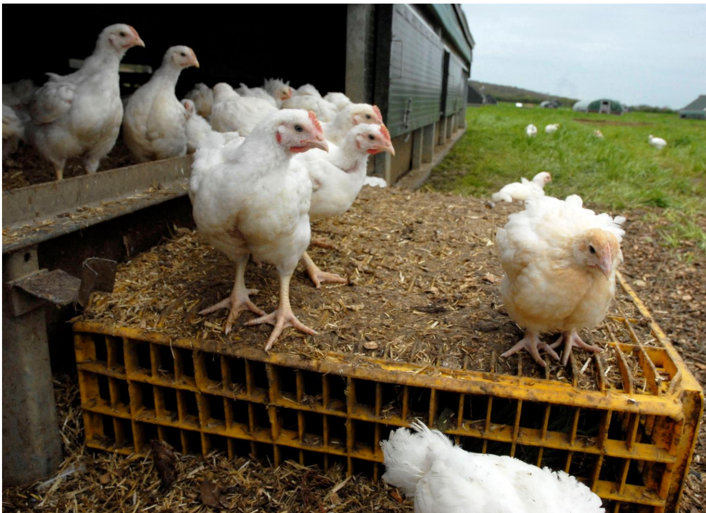
Image: Slower growing chickens in high welfare systems have been documented to have significantly less antibiotic use.