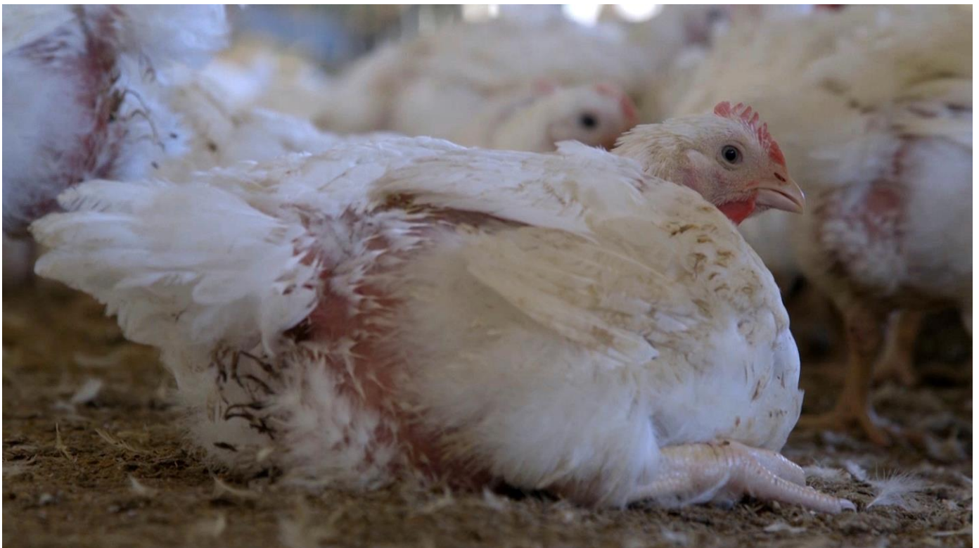
Image: Around 60 billion meat chickens are produced annually. They are selectively bred to grow at an unnaturally fast rate to produce cheap meat within 40 to 46 days.

“We have abundant evidence documenting the fact that when you put animals in crowded, unsanitary conditions and use low-dose antibiotics for disease prevention, you set up a perfect incubator for spontaneous mutations in the DNA of the bacteria [...] With more spontaneous mutations, the odds increase that one of those mutations will provide resistance to the antibiotic that’s present in the environment.” xx