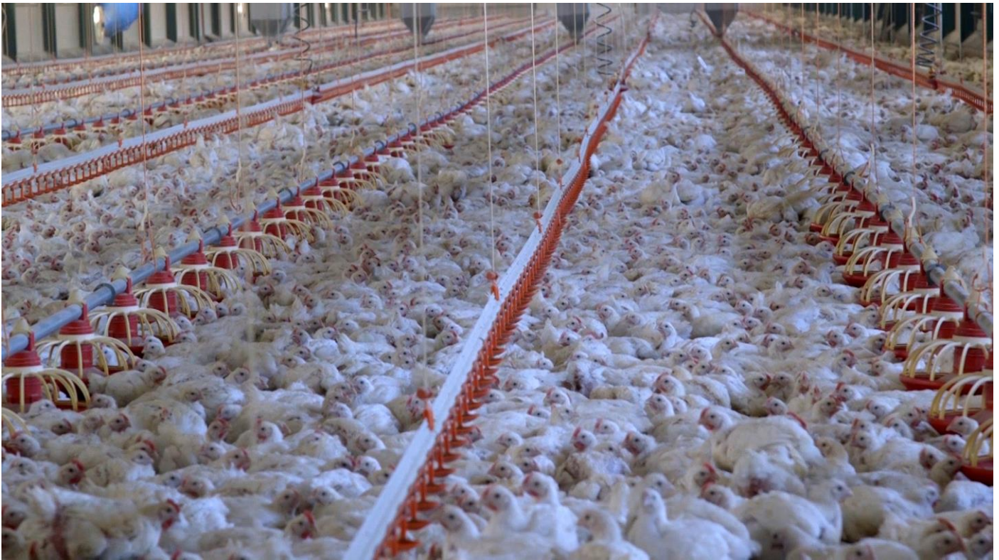
Image: Fast-growing breeds of chicken which suffer from terrible health problems, including deformed legs and hearts and lungs that struggle to keep up. In addition, chickens are kept in cramped conditions in a space less than an A4 piece of paper.