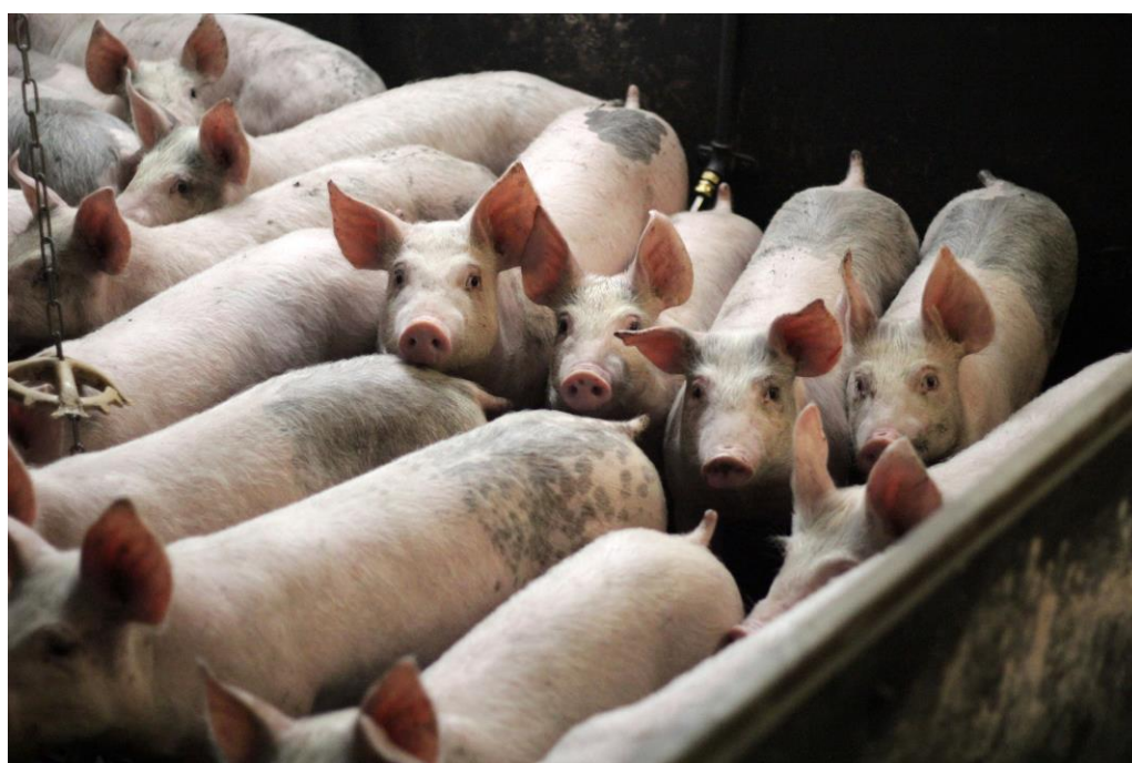
Image: Factory farmed pigs raised for meat are reared in overcrowded, barren pens. Their tails are cut in their first week of life to try and prevent tail biting. However, tail biting still occurs. Antibiotics are used in feed or water to prevent disease.

Despite the widespread problem of antibiotic overuse across animal farming, the industry is reluctant to disclose antibiotic use data. Asian aquaculture companies are particularly poor at reporting on antibiotic use, but there is a problem right across the animal protein sector. xxvii