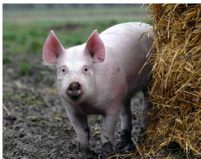
Image: Organic systems usually include outdoor access and have been shown to have reduced antibiotic resistance compared with raised without antibiotic factory farm systems.