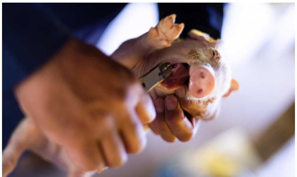
Image: A farm worker clips the teeth of a piglet 72 hours after he was born. This practice is associated with antibiotic overuse and can be avoided.

To achieve this, we are calling for concerted action from the global retail, finance and animal protein production sectors, governments, and intergovernmental organisations to phase out factory farming. Stopping this cruel and inefficient system, dependent on antibiotic overuse, is vital to protect people's health, animals and economies from future pandemics.