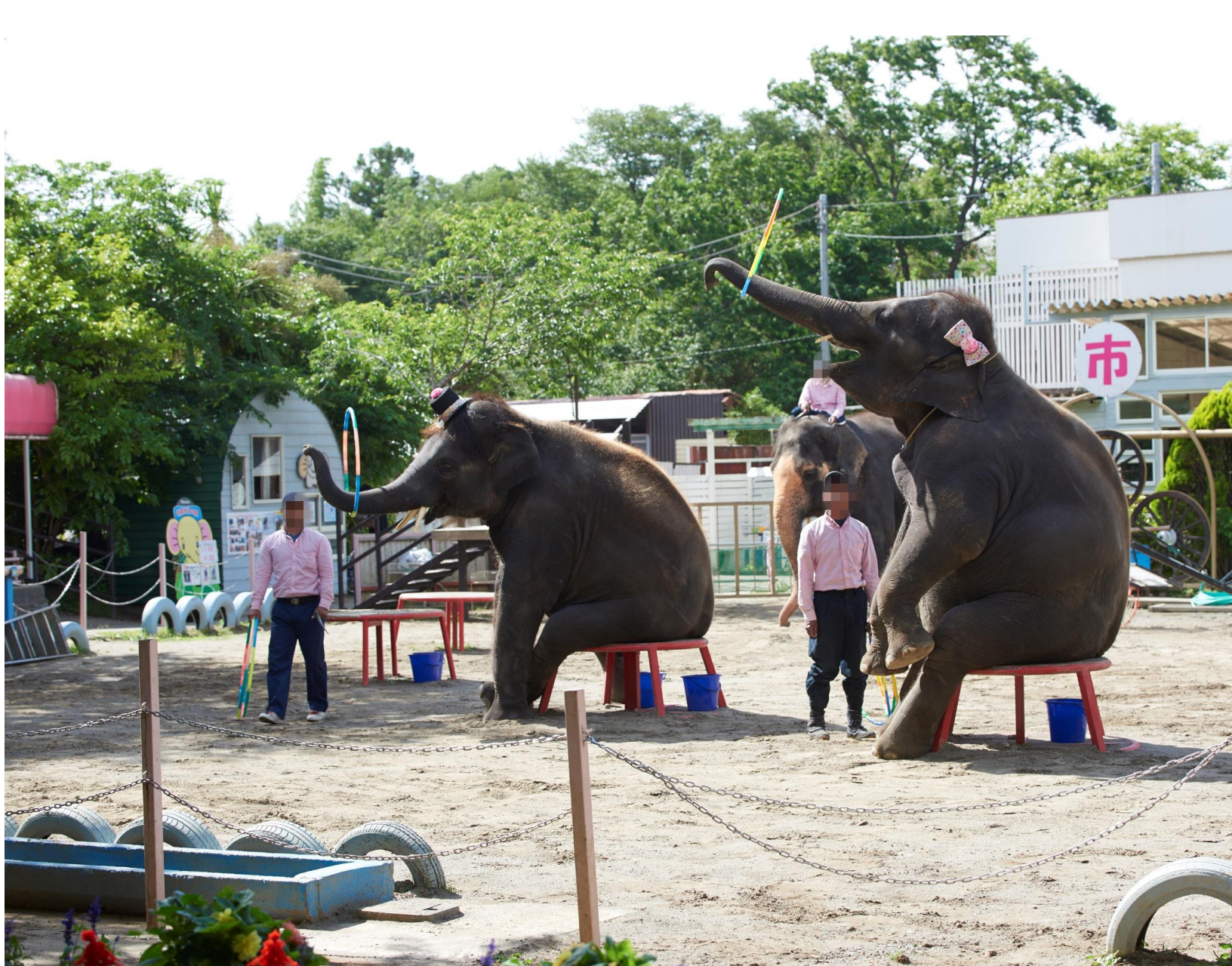
Photo: Ichihara Elephant Kingdom (Japan).