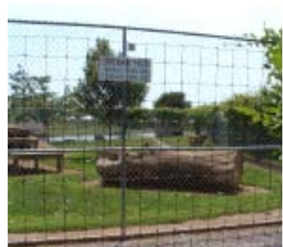
FIGURE 4.6 The primary fence of the tiger enclosure at Greenview Aviaries Park and Zoo, shown in the photo above, is approximately 10 ft (3.05 m) high and has no overhang.