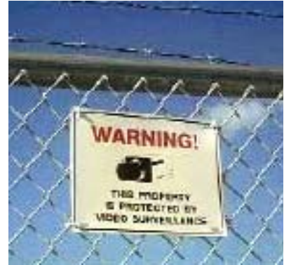
FIGURE 4.20 Security cameras can monitor both animals and people.

Liability insurance ensures that captive wildlife owners are covered in the event that someone sues as a result of being injured while visiting their zoo or animal collection. One such lawsuit involved a young couple, mauled by a tiger at African Lion Safari in Ontario. During the trial, the issue of liability was examined closely. The judge in that case found the zoo to be "strictly liable" for the harm caused to the young couple. That means that even if dangerous animals are securely housed, if something goes wrong, the owners are still responsible. This was true even though the facility had signs posted warning of the risks. In Canadian law, wild animals of all types are deemed to be dangerous to humans. The onus, in this potentially dangerous situation, falls squarely on the owner to ensure that no harm comes to visitors. It follows that any harm done in the future to individuals by a wild animal or animals will result in a similar finding of strict liability for the animal owner or keeper. The presumption of danger applies to the entirety of a species and is not limited to a specific individual animal. For this reason, some provinces require anyone keeping potentially dangerous animals or facilities that are open to the public to maintain a minimum of one to two million dollars liability insurance.