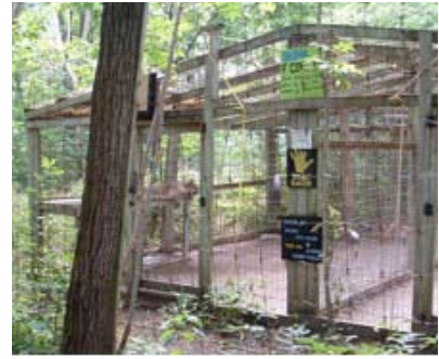
FIGURE 7.18 Cougar enclosure with roof

Many of the smaller, roofed big cat enclosures have sliding doors that allow the cats access to a larger uncovered area. While this provides more room for the cats, the fences in these open-topped yards appear to be about 12 ft (3.65 m) high and some of the struts supporting the overhangs are broken, resulting in areas of sagging (see Figure 7.19).