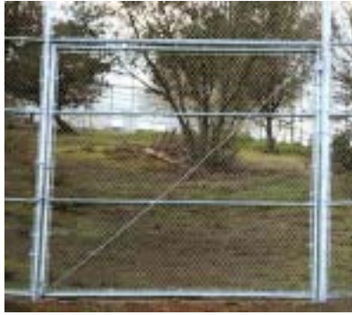
FIGURE 4.16 A secure, properly constructed gate at the PAWS Sanctuary

helps prevent the inadvertent escape of animals that may sneak past zoo staff entering the enclosures. While this system is advisable for all enclosures, it is absolutely necessary for exhibits housing potentially dangerous animals, like large carnivores.