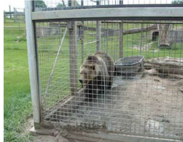
FIGURE 1.2 This bear enclosure at Northwood Zoo and Animal Sanctuary lacks sufficient features to keep the bear physically and mentally engaged. As a result the bear has little to do other than pace back and forth at the fence-line.

Even though Ontario is significantly behind other provinces when it comes to regulating wildlife in captivity, Ontario has the benefit of being able to look at what has and hasn't worked in the other provinces, and therefore has the opportunity to use that information to create the most effective licensing and regulatory regime in the country, one that provides the best level of protection for the people who keep, display, visit or live near wildlife in captivity and for the animals as well.