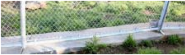
FIGURE 4.9 This fence at the PAWS sanctuary is fully secure at the bottom by strong posts being cemented deep into the ground