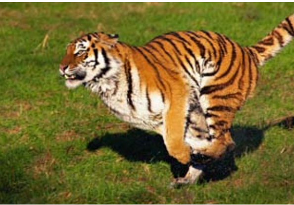
FIGURE 3.2 Many big cats can move with lightning speed.

Cheetahs are the world's fastest land mammal, and can sprint from zero to 70 m.p.h (96 km/hr) in only three seconds. These cats are nimble at high speeds, and can make quick and sudden turns in pursuit of their prey. They are usually 3.5–4.5 ft (1.05–1.37 m) in length and weigh 77–143 lbs (34.9–64.8 kg) and in the wild prey on small antelopes. They get as close as possible before trying to outrun their prey in a burst of speed, and once they are closed in, they knock their prey to the ground with their paws and suffocate with a bite to the neck.