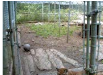
FIGURE 7.30 Cougar enclosure