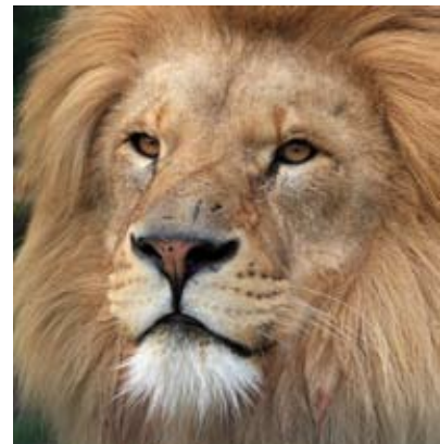
FIGURE 4.15