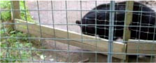
FIGURE 4.10 The black bear enclosure at The Killman Zoo, above, has gaps at ground level.