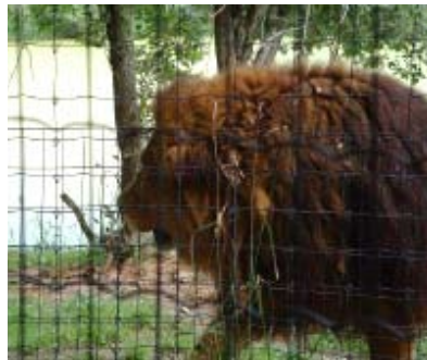
FIGURE 7.17 Lion enclosure without roof constructed from deer fence

The big cat enclosures are constructed of either chain-link fence or deer fence on wooden support structures. Several are covered, but the lion, cougar and jaguar enclosures are not (see Figures 7.17 and 7.18).