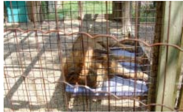
FIGURE 4.4 This African Lion enclosure at The Killman Zoo also provides very little space and enrichment.