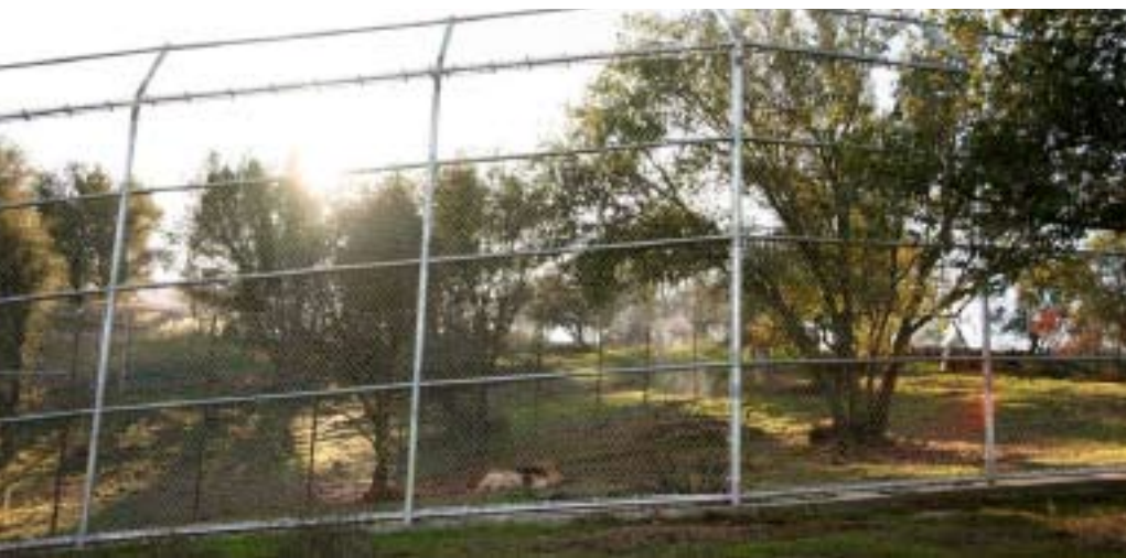
FIGURE 4.2 The spacious lion enclosure at PAWS is an excellent example of an appropriate enclosure designed to meet the needs of the animal

Figure 4.2 depicts the lion enclosure at the Performing Animal Welfare Society (PAWS) sanctuary in California. It is an excellent example of a diverse, spacious enclosure designed to meet the needs of the animals. The entire enclosure is approximately 3500 ft 2 (325 m 2 ) and includes a large exercise area for the cats as well as smaller 96 ft 2 (8.92 m 2 ) shift cages (not shown in the photo) to allow for safe cleaning and maintenance.