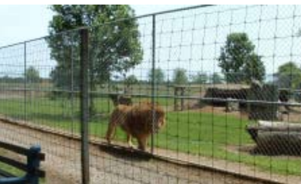
FIGURE 4.1 This African lion at Greenview Aviaries Park and Zoo has little to do in this enclosure and consequently spends time pacing along the fence line. The barrier also appears low, approximately 10 ft (3.04 m) high, and has no inwardly angled overhang to discourage jumping.

Some of the best large carnivore enclosures are located in professionally operated, accredited sanctuaries. These facilities focus on the needs of the animals, ensure that escape is not possible and incorporate all standard safety features and protocols. The enclosure design and care of large carnivores in accredited sanctuaries can be used as a benchmark for zoos wishing to improve their exhibits or for governments considering laws or regulations regarding the keeping of big cats in captivity.