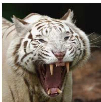
FIGURE 1.1

Zoo visitors, employees, volunteers and local residents may be put at risk due to inadequate barriers, cages and enclosures that have been constructed with little consideration of the natural abilities and needs of the animals they’re meant to confine. Lack of knowledge and inadequate finances are additional factors that may contribute to potentially unsafe conditions. In Ontario, there have been numerous animal escapes over the years, including big cats jumping fences that were too low and cages that collapsed because they were too weak. Surprisingly some animal custodians appear to overlook, ignore or be unaware of the risks animals pose to themselves and others. That may be why some facilities don’t even erect stand-off barriers to keep visitors a safe distance from the animal cages or post warning signs reminding visitors that contact with animals can be dangerous.