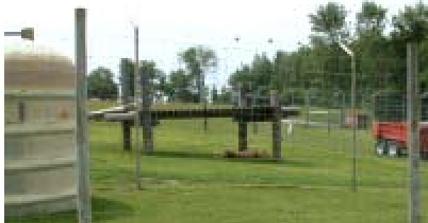
FIGURE 7.3 Low barrier used to contain tigers.

The primary tiger enclosure fences are constructed from 8 ft (2.43 m) high deer fencing attached to metal support posts with wire twists. The type and strength of deer fencing used appears inappropriate for tigers and other large carnivores.