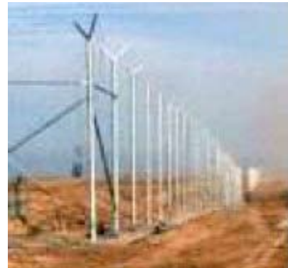
FIGURE 4.18 High fence topped with both inward and outward overhangs is effective for containing big cats.