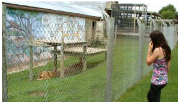
FIGURE 7.4 Extremely low barrier at lion enclosure.

Tigers have been known to clear 16 ft (4.87 m) high enclosure barriers, so it would appear the relatively low barriers at this facility are inadequate for containment of these animals.