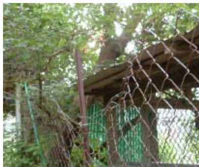
FIGURE 7.24 Damaged stand-off fence in front of lion cage

The stand-off barriers are positioned from 2–5 ft (.61–1.52 m) away from the primary barriers, with the closest being in front of the black bear enclosure.