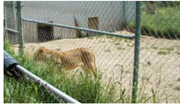
FIGURE 4.3 This African Lion enclosure at Guha’s Tiger and Lion Farm is severely limited in terms of space and complexity