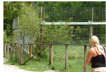
FIGURE 7.35 Bengal tiger enclosure

The stand-off barriers in front of the cat enclosures are constructed of wire mesh fencing attached to wooden posts. They are positioned 3–6 ft (.91–1.83 m) from the primary barriers. Each had a swinging gate, the one at the jaguar cage being unlocked with just a piece of twisted wire holding it shut.