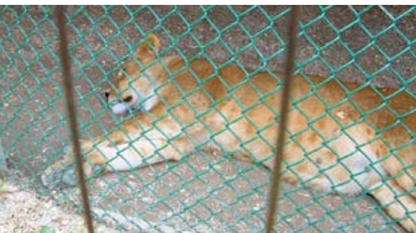
FIGURE 4.7 This relatively light gauge chain-link fencing is being used to contain a lion at The Killman Zoo.

In some cases in Ontario, it appears the type of fence barrier used is not based on strength, durability or ability to contain the species on display; but on cost. It sometimes seems one kind of fencing has been bought in bulk and then used to construct all the animal cages. This can result in enclosures that lack sufficient strength to effectively contain the animals. For instance, chain-link fence is made up of long strands of steel wire that are intertwined to resemble a net with large diamond shaped holes. The ability of chain-link fencing to withstand pressure, which is needed when housing large animals, depends on its mesh density and gauge. The strength of the fence increases with a tighter, denser mesh. Wire mesh fencing is priced according to gauge, with values between 13 and six, with 13 being the thinnest wire and six being the thickest. Anything weaker than a nine gauge chain-link fence will likely not withstand the pressure of large animals pushing on or jumping against it. Many large carnivore enclosures in Ontario's zoos appear to be constructed of relatively weak fencing that may not be sufficient to withstand a physical challenge or ongoing deterioration and damage.