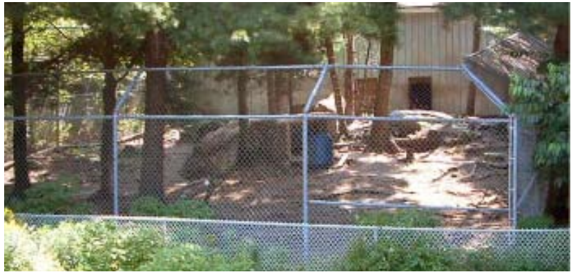
FIGURE 7.26 Adult lion enclosure at the Guha facility.

The largest of these enclosures housed an adult male lion (see Figure 7.27). There was a large gap between the gate and the service building that the fencing was attached to.