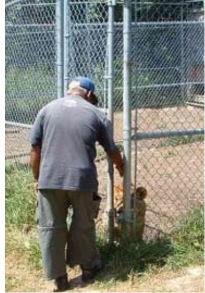
FIGURE 7.28 Gap at the gate to the juvenile lion enclosure