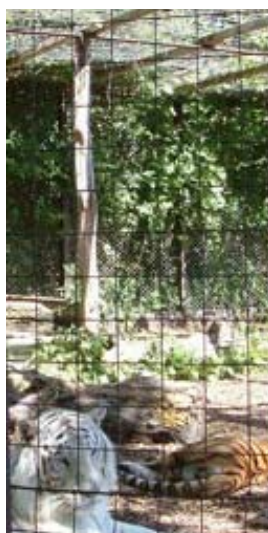
FIGURE 4.13 The wooden roof support post in the tiger enclosure at The Killman Zoo, shown in the photo above, has been damaged, presumably from scratching or biting.

Most zoo associations recommend barriers 16.5–20 ft high for tigers and other big cats or roofed enclosures.