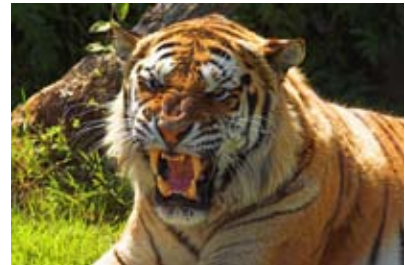
FIGURE 3.1 The claws, teeth, size and strength of many animals make them inherently dangerous.

Leopards are the strongest climbers of all the large cats and are capable of bringing down prey larger than themselves. They are usually 4.5–6.5 ft (1.37–1.98 m) in length and weigh between 82–200 lbs (37.1–90.7 kg). Leopards are able to run in bursts up to 58 km/hr (36 m.p.h), leap 20 ft (6 m) forward in a single bound, and jump 10 ft (3 m) straight in the air. They are also incredibly strong, as they can climb as high as 50 ft (15 m) up a tree holding prey in their mouth, even prey that are larger and heavier than they are. One of the rarest subspecies is the snow leopard, which is able to jump as far as 50 ft (15 m). While rare in the wild, they are periodically found in zoos across Canada.