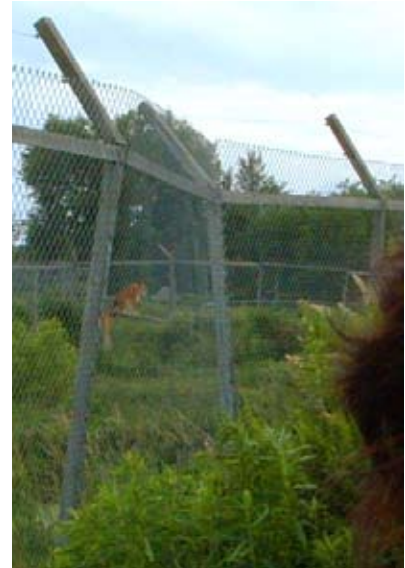
FIGURE 4.14 The wooden support post for this lion enclosure at Papanack Park Zoo, located on the inside of the fencing, is not reinforced with mid-level horizontal struts and the upper portion mesh is not well secured in places. Several of the support posts for this cage were tilted.

Animal enclosures should ideally all be equipped with a double-door entry system, an access system where one door is opened, entered and then closed prior to the second door into the actual enclosure being opened. This system