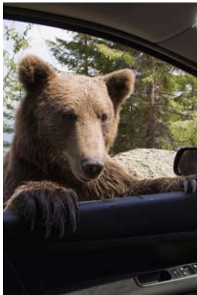
FIGURE 3.3 Bears are intelligent, curious and powerful.

Cougars , also known as pumas, mountain lions and catamounts, are the second largest cat native to the American continents. They vary considerably in size and weight, depending on their location. In North America, adult males weigh on average 156 lbs (71 kg), with a body length of slightly more than two metres and females weigh on average 90 lbs (41 kg), with a body length of slightly less than two metres. Cougars are well adapted to hunt, with extremely strong forequarters and necks—their muscular jaws and long canine teeth are designed for clamping down and holding prey larger than itself, and its teeth are specially adapted for cutting meats. Cougars attack their prey with a lightning-fast charge and a fatal bite to the back of the neck. Victims are most often killed by suffocation with a prolonged bite across the throat, collapsing the windpipe. The prey's neck may also be broken with a single bite. From time to time, cougars attack people, statistics show that cougars usually attack children or solitary people and, on average, cougars attack about five people each year in North America, with generally one of those attacks being fatal.