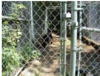
FIGURE 7.29 Jaguar enclosure