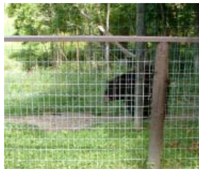
FIGURE 7.25 Stand-off barrier in front of black bear enclosure