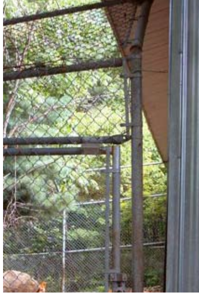
FIGURE 7.27 Gap between gate and service building